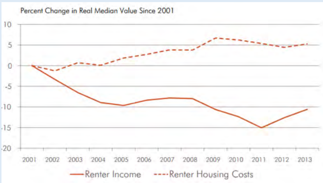
Source: JCHS Projecting Trends in Severely Cost-Burdened Renters: 2015–2025 Report